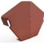
Angle Ridge Cap HD IPTDV/AR