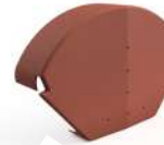
Half Round Ridge Cap HD IPTDV/HR