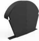
Half Round Ridge Cap HD IDV/HR