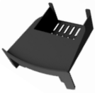
Starter Unit HD IPTDV/ST