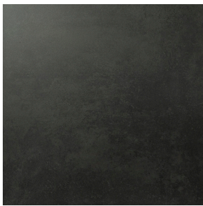
Blackrock PEI I