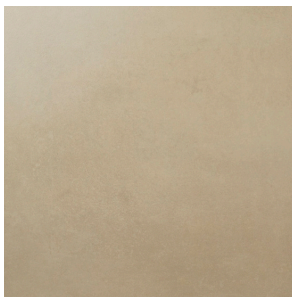
Sand Dune PEI III