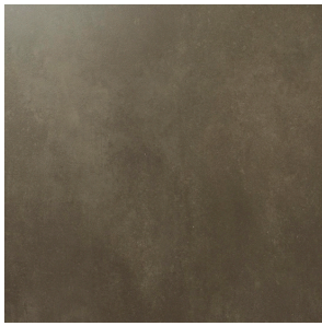
Natural Slate PEI II