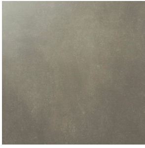
Greystone PEI II