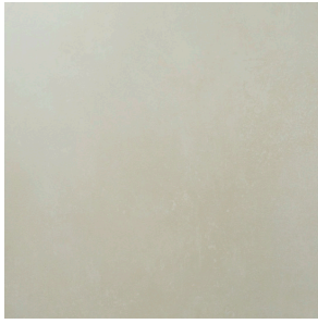
Stone White PEI IV