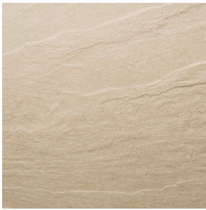
Yorkstone PEI III