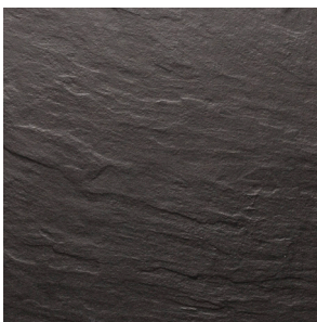
Welsh Slate PEI III