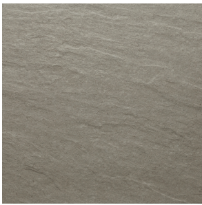
Granite City PEI III