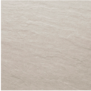
Portland White PEI IV

Four colours offering a neutral and contemporary palette.