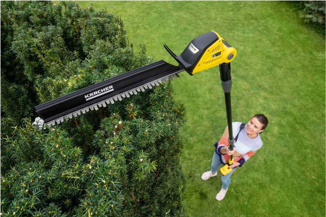
PHG 18-45 Cordless Pole Hedge Trimmer (Machine Only)

■ Battery-powered, battery and battery charger available as optional accessories