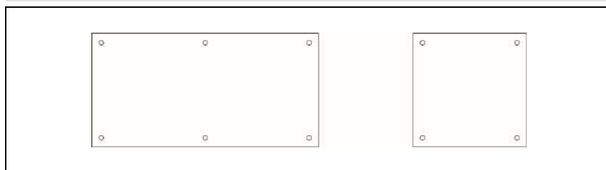
Figure 1 Minimum layout of fixings

A.7 The waterproofing membrane is mechanically fixed, the securing requirements of which should be considered separately.