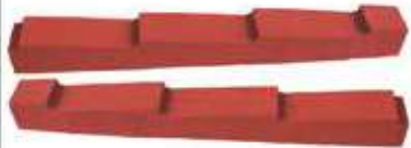
Dry Verge Length: 111cm Width: 10.7cm Height: 12cm Usable surface: 94cm