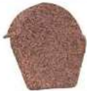
End Cap Fits over the end of the ridge tile and forms a perfect seal