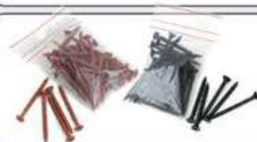
Plastic Coated Screws (Available colour coded) 40 x (4.0 x 45)

This roofing system is made from a mixture of virgin and recycled polypropylene plastic, resulting in an incredibly tough, durable, lightweight roofing solution.