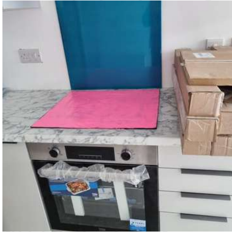
5.1. Induction hob