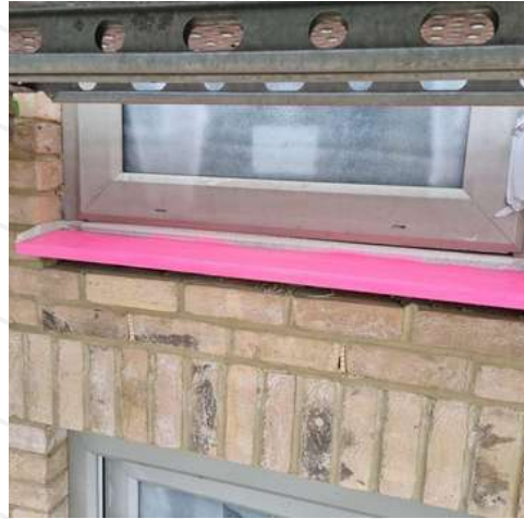
5.2. Window sill