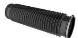
110mm Flexi-Pipe RTV-KIT1