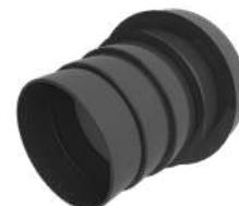
Multi Adapter RTV-ADMULTI