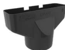
Standard Adapter RTV-ADS