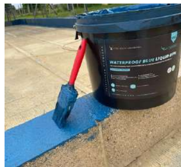
Applied to kicker block