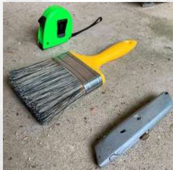
Tools you will need