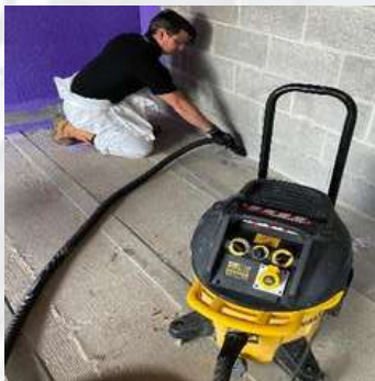
Clean all areas