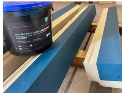
Concrete window sill