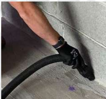
Clean all areas