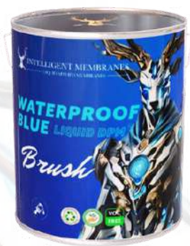
Waterproof Blue Liquid DPM (Also available in White)