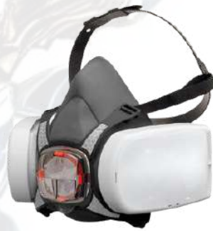
Face fit mask