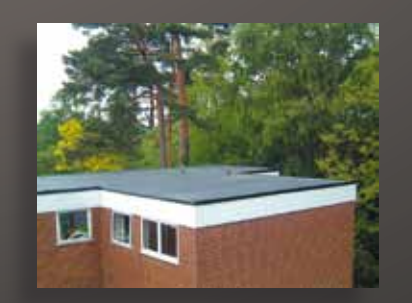
Avenir Roofing Ltd Ensign House, Lisle Road, High Wycombe, HP13 5SH

Having installed thousands of EPDM rubber roofs , we are your perfect supply partner and can assist you with any technical or logistical challenges that you may encounter. We buy EPDM in huge quantities direct from the USA and our considerable buying power means we can pass our savings onto you, resulting in the best possible service and outstanding prices. We are the most competitive EPDM supplier in the UK and will beat any alternative quote.