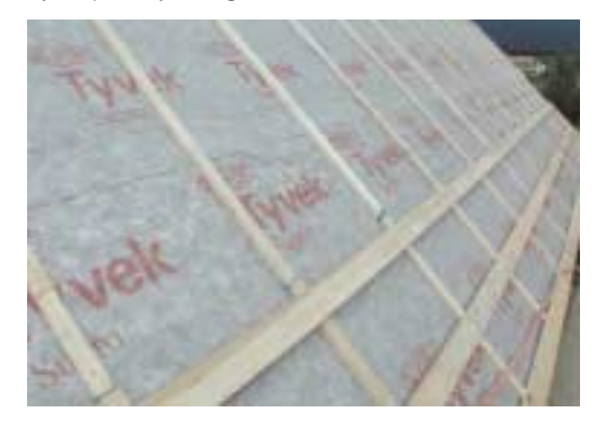
5. The metal roof panels are fastened on top of the counter-battens.

4. Vertical wooden battens are installed at specified spacing. If horizontal counterbattens are specified, they are fastened on top of the vertical battens, again using the specified spacing.