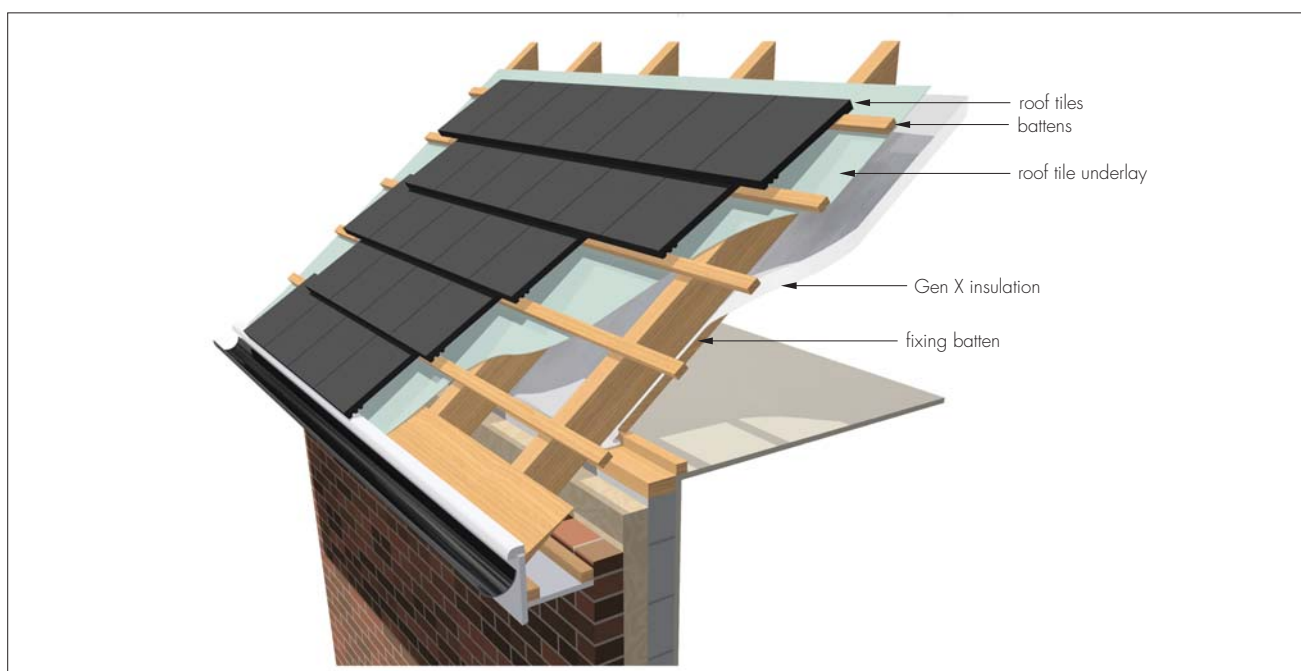
Figure 2 Installing Gen X below rafters

14.14 Any exposed cut edges of the product should be sealed with a suitable adhesive tape. Any tears or holes in the outer layer should be repaired with Gen X tape.