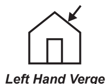
Left Hand Dry Verge Unit (GPPV-LH)