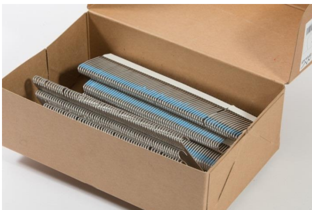
Figure 5 – Example of Innofix Clip packaging

Innofix Clips come in boxes of 500 clips, with approximately 50 clips per Magazine. Product codes are listed below.