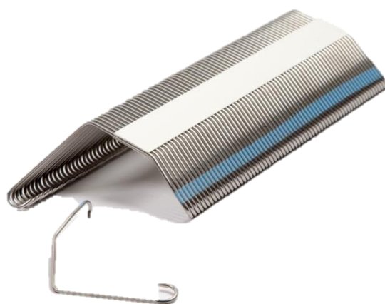
Figure 3 – Innofix Clip Magazine

To help minimize the effects of these costs, Redland has developed Innofix Clip. It is a BS 5534-compliant, tool-free clipping system designed to fit Redland's profiled tiles. It is up to 40 % quicker to install than traditional nail and clip, and can be fitted one handed. Supplied on a magazine of approximately 50 clips.