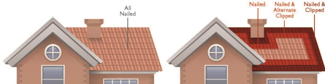
Figure 2 – Example of tile fixing before and after in Hereford

All tiles at the perimeter of the roof must be nailed and clipped. In addition, a band of full tiles 2 wide adjacent to the perimeters must also be clipped in an alternate diagonal pattern. All other tiles must be nailed using 70mm x 3.75mm aluminium alloy clout nails.