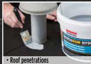
• Roof penetrations