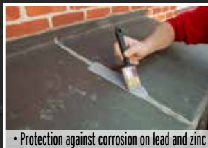
• Protection against corrosion on lead and zinc