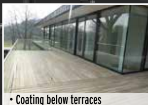
• Coating below terraces