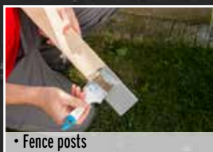
• Fence posts