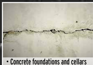
• Concrete foundations and cellars