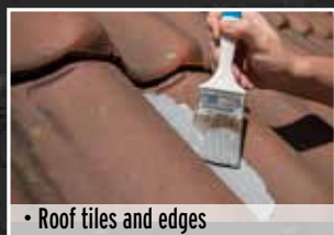
• Roof tiles and edges