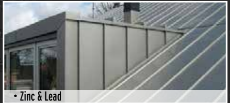
• Zinc & Lead

Other substrates: Screed, ceramic materials, brick, copper, ABS and aluminium