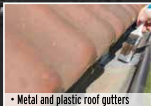
• Metal and plastic roof gutters

SEALING AND PROTECTION OF INTERIOR AND EXTERIOR JOINTS, GAPS, CRACKS AND CONNECTION AREAS.