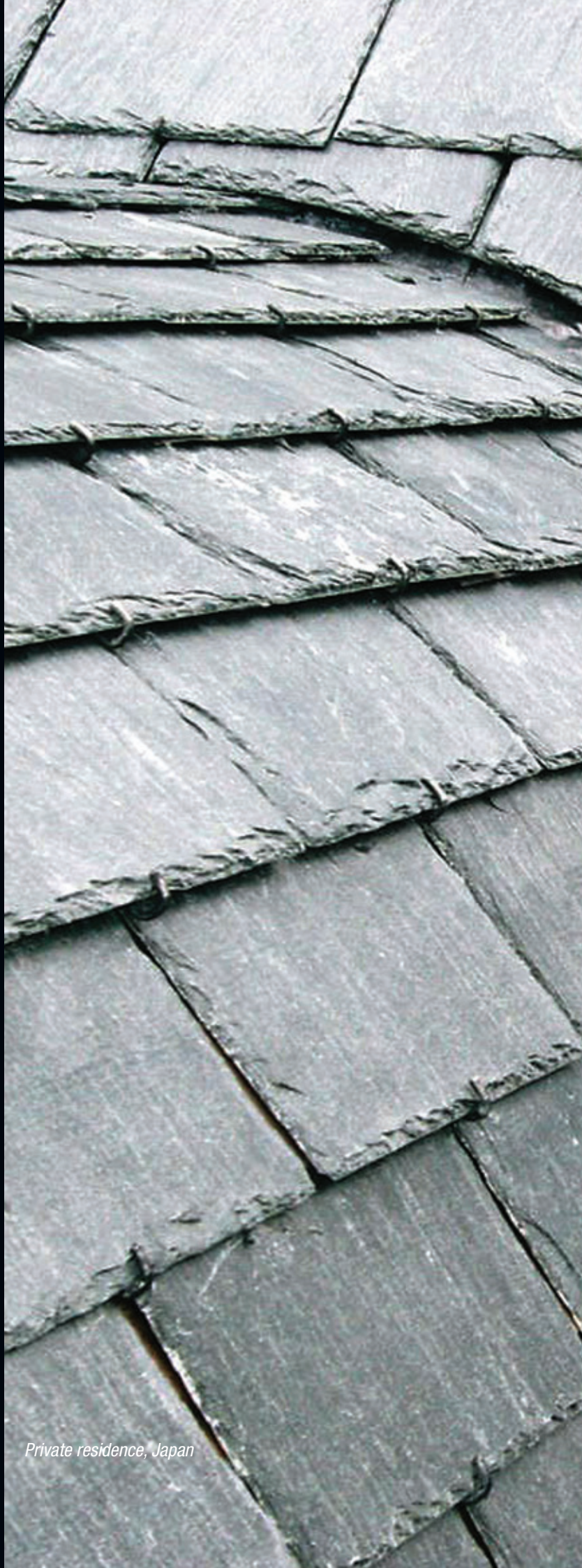
Private residence, Japan