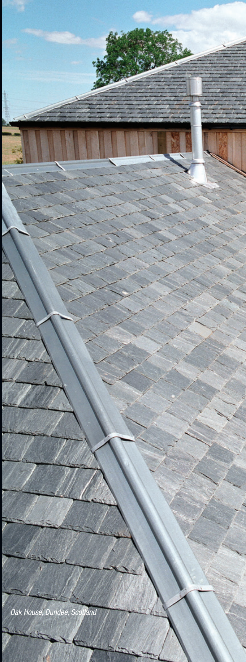
Oak House, Dundee, Scotland