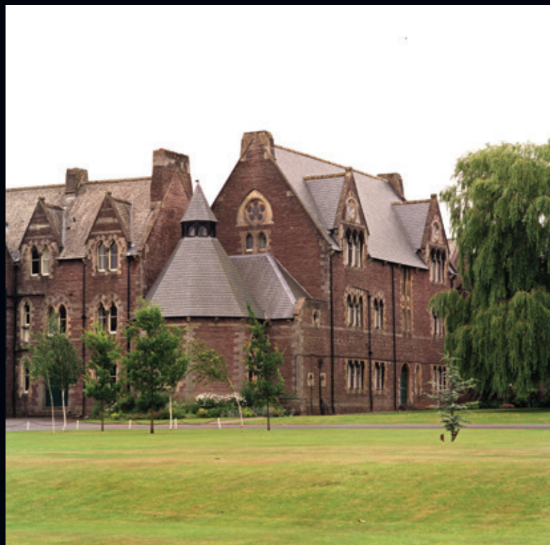
Christ College, Brecon, Wales

Riverstone is accepted as an alternative to indigenous materials. An example of this can be found on the right, where Riverstone had been chosen to replace a 300-year roof supplied from local materials in Brecon, Wales.