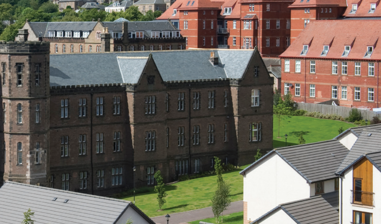
Royal Infirmary, Dundee, Scotland