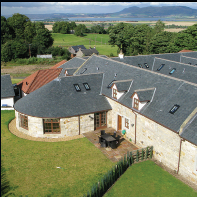
Flock House Farm, Aberdeen, Scotland

But we do not rest on the laurels of our exceptional stone. Through a policy of continual improvement, our yields have steadily climbed over the years. We now help to set the standard for efficiency in the slate sector.