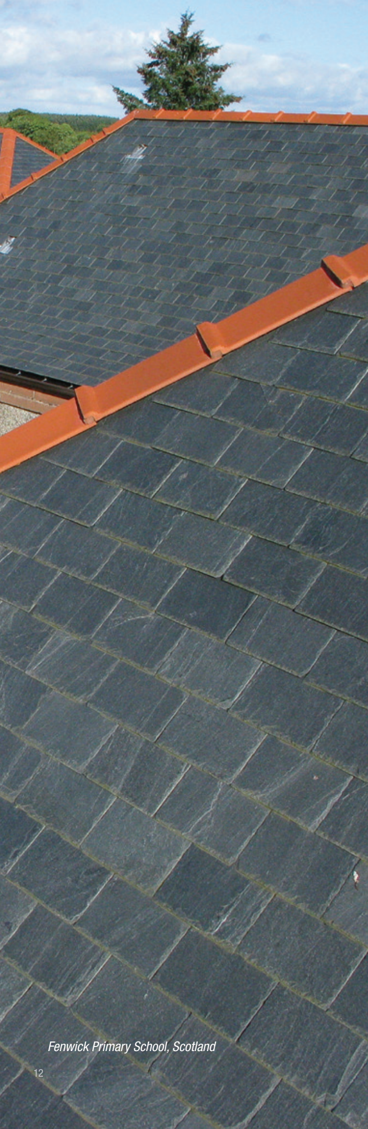
Fenwick Primary School, Scotland