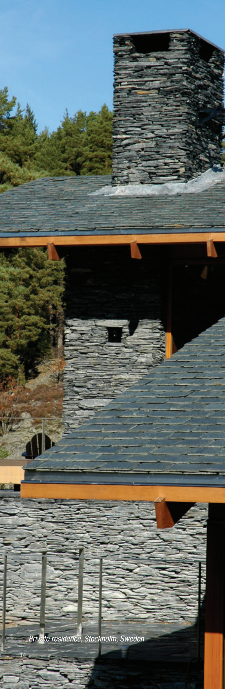
Private residence, Stockholm, Sweden