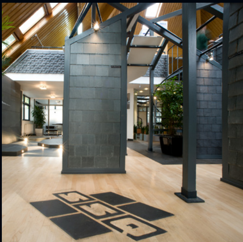
SSQ Headquarters, London

Riverstone, featured here, is our signature slate.