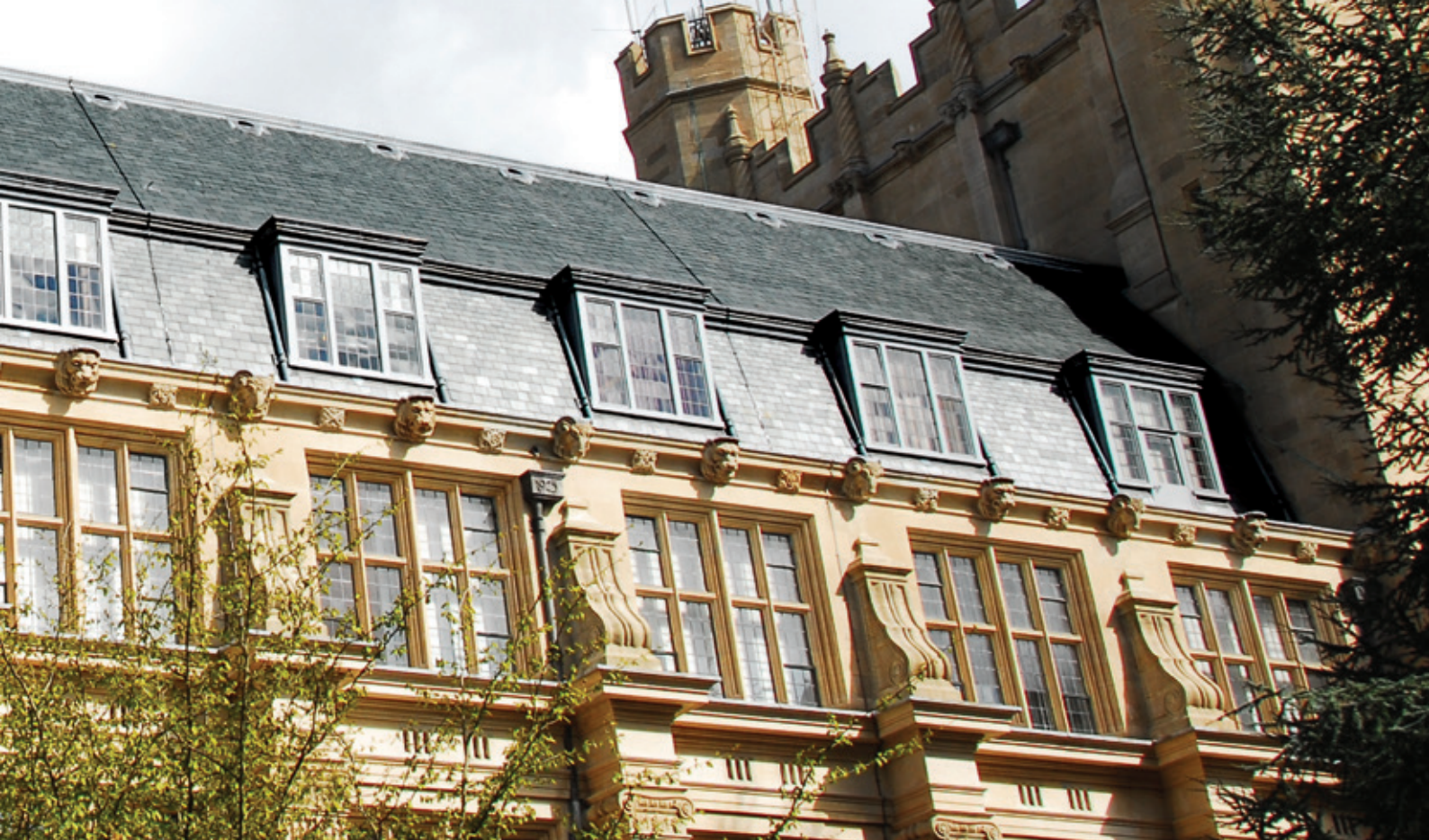
Bristol University, Bristol, England