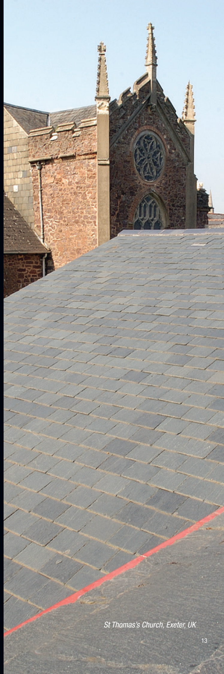
St Thomas's Church, Exeter, UK