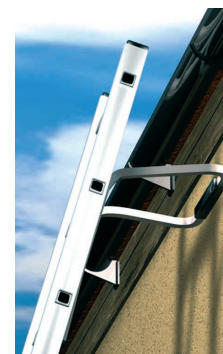
Ladder Stand off