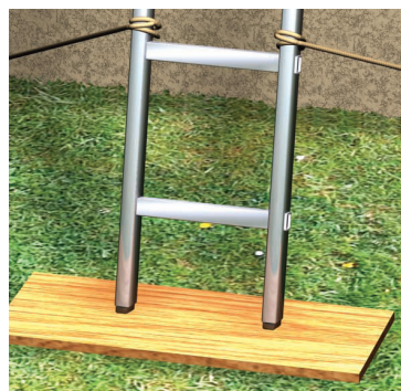
Base Tied Back

Call: +44 (0)1621 745900 for more information.