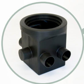
BDSCI - Distribution Chamber Chamber allowing even gravity distribution of pre-treated effluent via the distribution pipes.