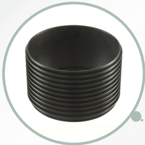
B3151 - Riser 185mm deep riser to accommodate deeper inverts.

Brett Martin's new Sampling and Distribution System is a gravity fed sub-surface irrigation solution which provides for the distribution of pre-treated sewage effluent from single domestic dwellings to an underground disposal area.