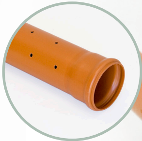
4123 - Percolation pipe 110mm Perforated pipe through which pre-treated effluent is discharged to the infiltration trench or bed.