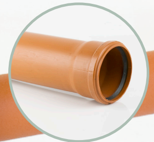
4406 - Distribution Pipe 110mm Solid-wall single socketed pipe used to connect the distribution chamber to the septic system via a single inlet point.