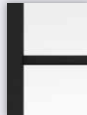
Slim timber profiles